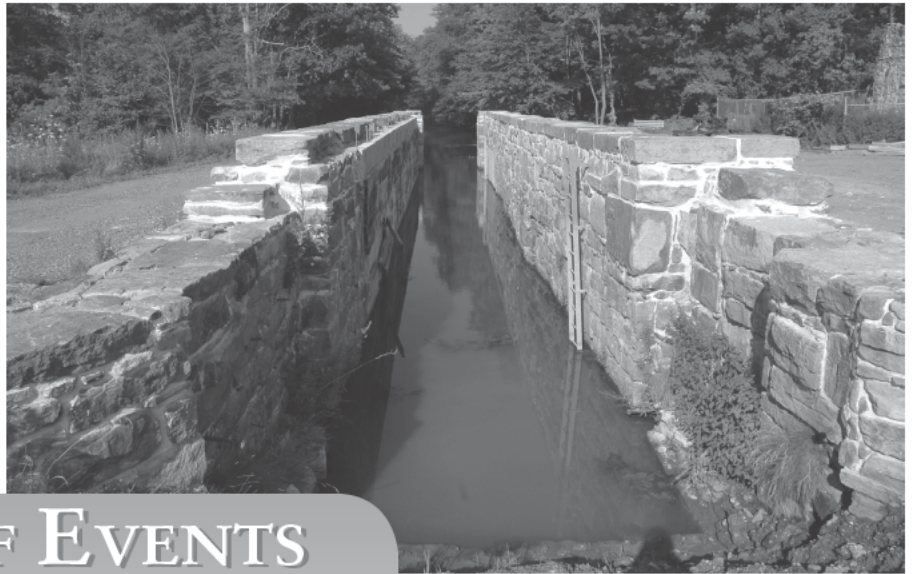
Lock 2 East at Wharton is scene here with stone work almost complete, waiting the new miter gates to be install at the far end.

In Wharton, Phase II of the Lock 2 East Restoration Project is now underway. The original capstones have been re-installed and the lock walls brought up to their historic height. Meanwhile, new miter gates for the lower end of the lock are being built by a company in Pennsylvania and will be delivered and installed in the fall. In addition, damaged interpretive panels are being replaced and a new panel created with help from a grant from the Morris County Heritage Commission. Plans for Phase III include rebuilding the upper drop gate and making the lock operational. ■