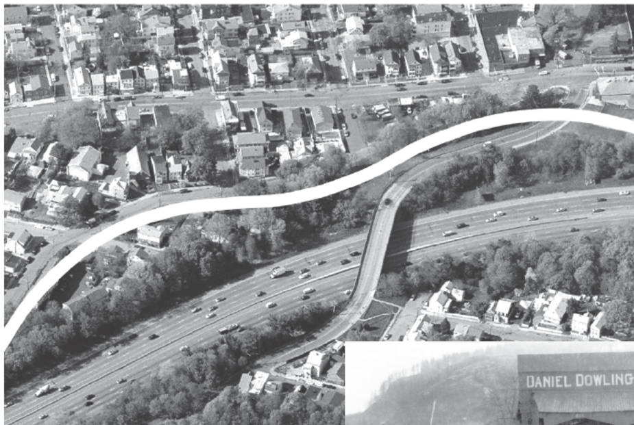
An aerial view showing the alignment of the Morris Canal near the intersection of Grand and New Streets in Paterson. This short section of canal prism will become Paterson Canal Park.

Space is limited, so reservations are required. To reserve a space, e-mail morriscanal@gmail.com . ■