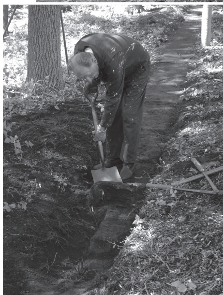
Above: Volunteers filled dumpsters with brush and debris removed from the site of Plane 9 East in Montville.