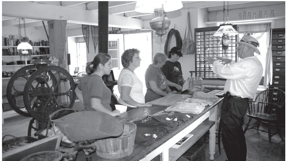
Visitors to Waterloo find Smiths Store fascinating, learning about the merchandise the canallers and village residents would have been able to purchase there in the late 19th century/turn of the 20th century.