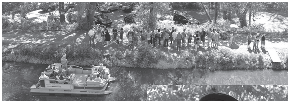
Visitors to the State History Fair await their turn for the Society canal boat ride.

Most recently the "Canal Explorer" plied the Morris Canal at Wharton Canal Day on August 18th. A beautiful day brought a big crowd and just under