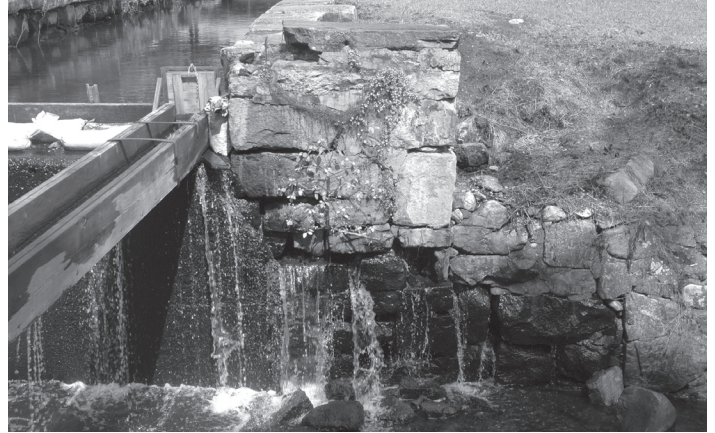
The downstream end of the masonry portion of the canal lock at Waterloo is in jeopardy of collapsing, as indicated by the water leakage evident in this photo.

The very historic Ironmaster's House at Waterloo is one of the most important structures at Waterloo. Parts of it date from the mid-1700s, the late 1700s and the 1870s. It is a very important survivor of the original pre-Revolutionary War Andover Forge