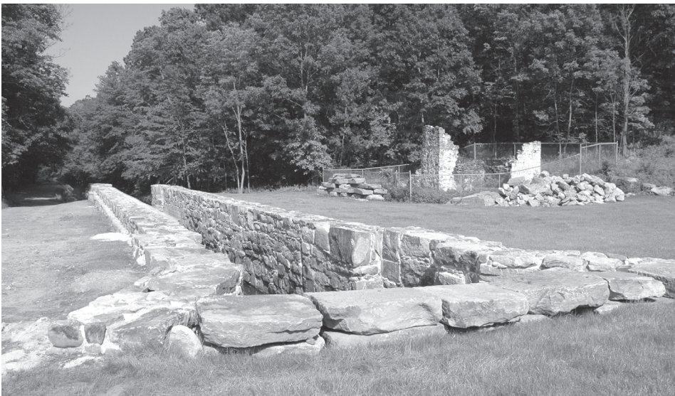
The masonry walls of Morris Canal Lock 2 East are nearly restored to their historic height in this photo of the in-progress lock project in the Borough of Wharton.

Congressman Bill Pascrell, Jr. recently announced that a $532,566 Federal Highway Administration Grant has been awarded to Passaic County to further implementation of the Morris Canal Greenway in Clifton and Paterson. The grant will be used to create bike lanes along the Morris Canal Greenway, in addition to upgrading sidewalks and installing 1,600 signs to ensure the safety of pedestrians, bicyclists and other recreational users. The project will create five miles of greenway trail in Clifton and three miles in Paterson. The Freeholders are very grateful for this federal grant and to all the dedicated volunteers who are helping make the Passaic County Morris Canal Greenway a reality.