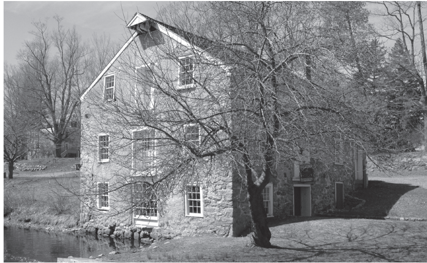
Smith's store at Waterloo, scene here in the early spring, is one of the best preserved canal stores along the canal. This year the store will once again be open to the public with a costumed interpreter to show off its wears.