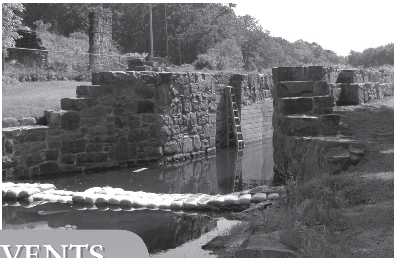
Wharton's Lock 2 East after the completion of the first phase of its restoration project.

This year's Wharton Canal Day will be bigger than ever. In addition to the newly restored Canal Lock and the CSNJ Canal Boat ride there will be more vendors and live music than ever before. The Canal Day site will now include several additional acres of land along West Central Avenue recently acquired by the Borough of Wharton. Rail fans will be interested to know the old Wharton & Northern bridge abutment on that site will be preserves and press back into service as a band shell. ■