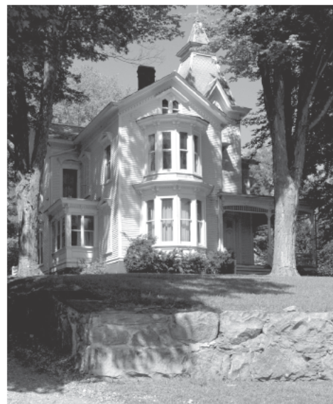
Waterloo's Seymour Smith house.

We also plan to reorganize our Waterloo summer programming around a canal town theme and develop two new interpretive areas. Watch for the lead story in the next newsletter for more details. ■