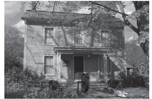
Canal Society's New Jersey Canal Museum at Waterloo.

be held rain or shine. Society members are needed to help us operate the pontoon boat ride. Please volunteer your services by calling Judy Keith at 973-347-9199. ■