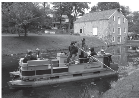
Waterloo volunteers take another group of visitors for a ride on the Society's canal boat.

Overall, during this past season at Waterloo the Society attracted nearly