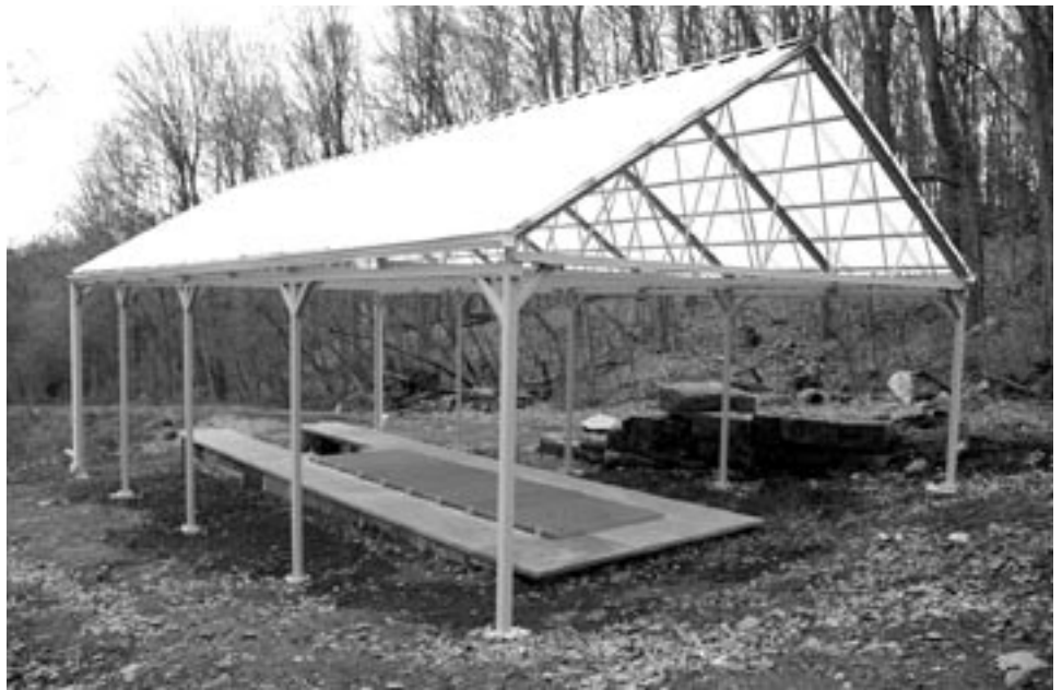
New pavilion that protects turbine chamber opening at Plane 2 East. Steel grating covers the chamber opening, but an access stairway allows public viewing down into the chamber.