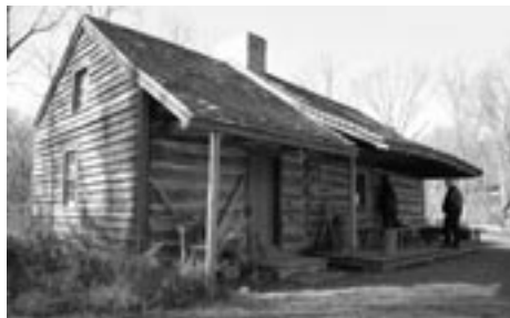
The 1820's Rutan Cabin at Waterloo.

We all must remain vigilant and be ready once again to resoundingly let our legislators and the Governor know how important our parks and history-related programming are to the public. We will know more about specific budget proposals by the Society's May membership meeting and will once again be seeking your help to advocate for preservation of our parks and historic sites. ■