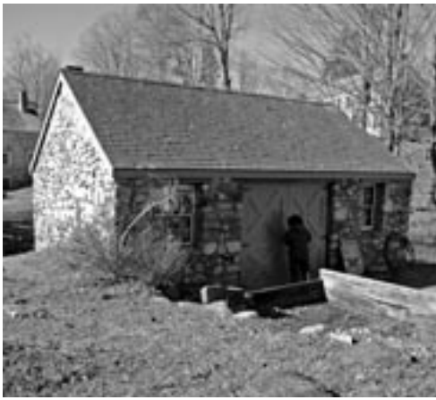
Blacksmith shop at Waterloo.