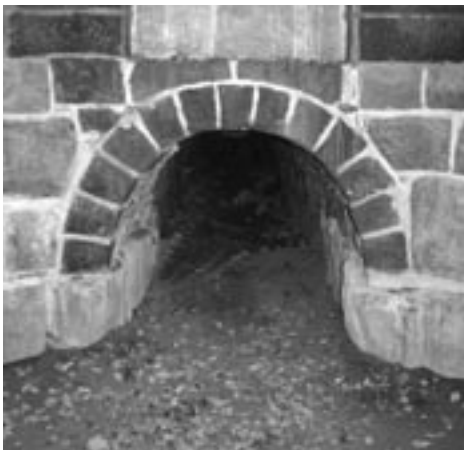
Newly restored tailrace arch in turbine chamber of Plane 2 East. Prior to the project the arch was collapsing.