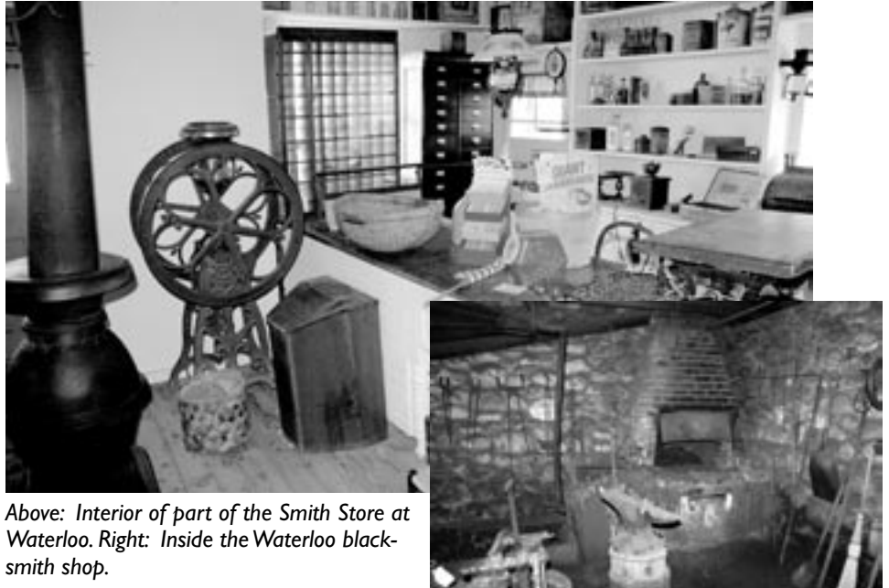
Above: Interior of part of the Smith Store at Waterloo. Right: Inside the Waterloo blacksmith shop.

The State has expressed its great pleasure with the results of the Society's Waterloo canal programming and discussions have already begun regarding coordination of Waterloo Canal Day and Canal Heritage Days in 2009. The dates and details for these events will be announced in the spring edition of On the Level . As always, we rely heavily on our member volunteers to make these events