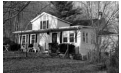
The Mahler House, a proposed Morris Canal Greenway trailhead facility.